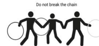
5. Team Hula