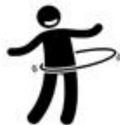
2 Hula hoop