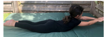
8. front straddle